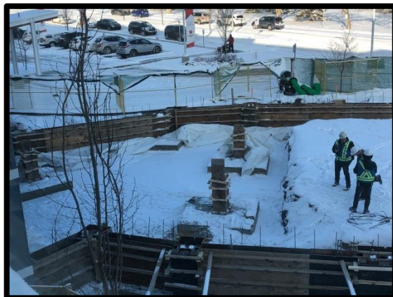
Second concrete footing pour for the new Chapel

2020 will be the year to complete the Chapel and fundraise for the Liturgical supplies to celebrate Catholic Mass. We will also be finishing the campaign to purchase the new custom wheelchair accessible bus and establish a transportation budget. Plans will be implemented for the continued renovation projects at Father Lacombe Care Centre. Our annual major fundraising event—the Legacy Dinner will be held on Friday, April 17 th , 2020 this year.