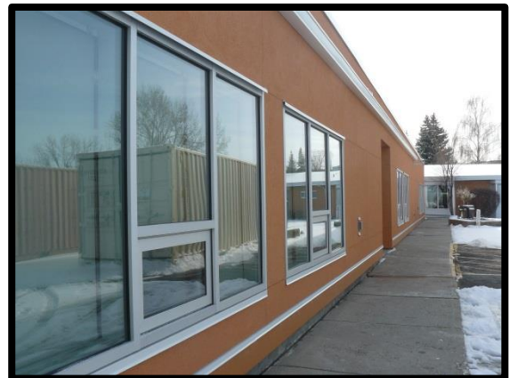
Newly renovated exterior on the north west corner of the main building at Father Lacombe Care Centre