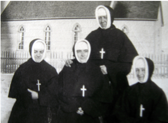
The original four sisters at the cottage

Father Albert Lacombe's last mission, the building of the Lacombe Home in Midnapore at 82, was the "most beautiful dream" of his life. With support from friends like Senator Patrick Burns and Lord Strathcona in the form of land and a financial donation, the dream turned into reality.