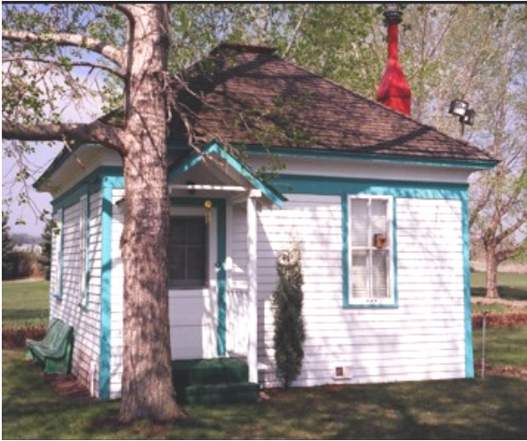
The cottage where it all started in 1910