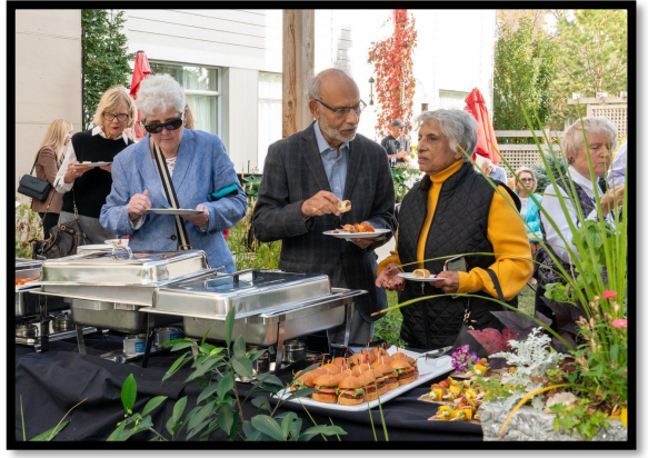
Attendees enjoying the delicious food provided

In a heartwarming gathering of generosity and unity, over 60 donors gathered together to celebrate the development of the Healing Garden. The Healing Garden is a beautiful oasis carefully designed with our memory care resident's enjoyment in mind. This celebration marked our first in-person event since COVID, held outdoors in the garden on a breezy, sunny September afternoon.