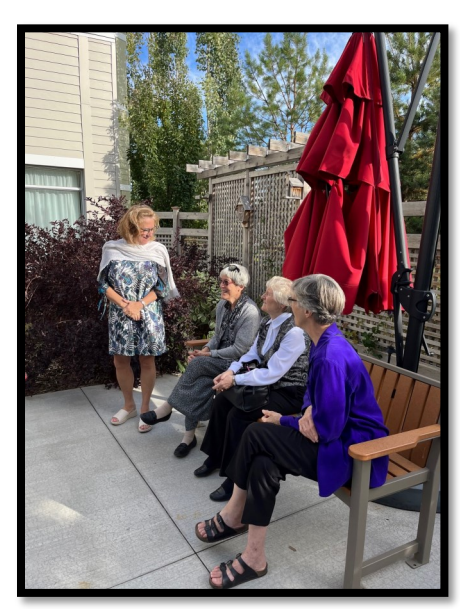
Attendees enjoying the fall sunshine