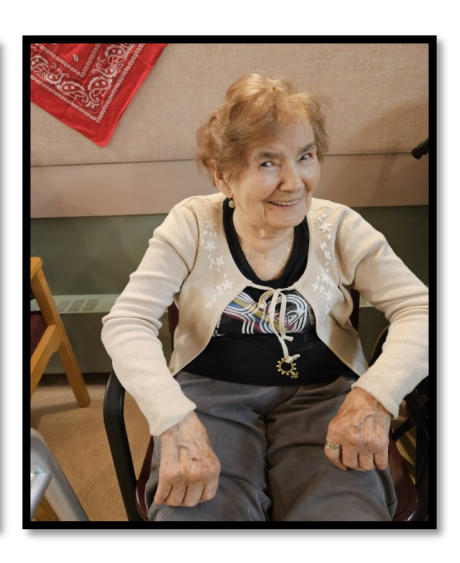
With your help and the work of our committed staff we had a great time during Stampede